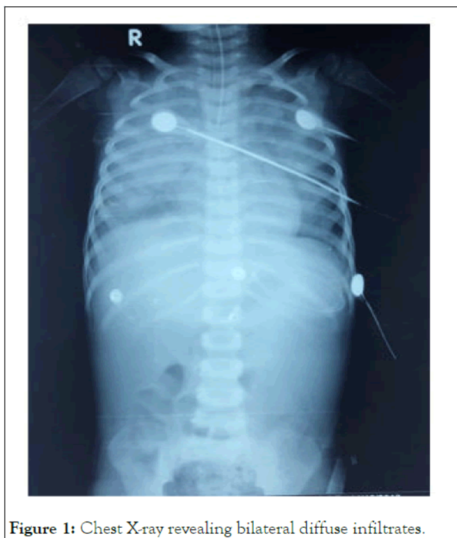
Figure 1: Chest X-ray revealing bilateral diffuse infiltrates.

A 2-year-old male baby presented to the ER in a comatose state with rapid, shallow breathing. There was a history of fall of wooden plank over child's head 1 hour prior to admission and 2 episodes of vomiting. On admission GCS was 5 (E1V2M2), pupils were bilateral equal and reacting. Airway was compromised with pooling of secretions in the oral cavity with bilateral rales on auscultation. He had an SPO 2 of 86 at room air, HR-114 bpm, Feeble pulse and BP-70/40 mmHg. His ABG revealed respiratory acidosis and ECG showed ST elevations in leads V4-V6. He was intubated in view of low GCS and threatened airway, that revealed frothy secretions. Bedside USG revealed no evidence of cardiac or abdominal injury. Chest x-ray revealed bilateral congested lung fields suggestive of pulmonary edema and bedside 2D Echocardiography revealed dilated left atria and left ventricle with LV global hypokinesia, ejection fraction of 15%. Troponin I and CKMB were within normal limits. Patient could not be shifted for CT head because of persistent hypotension despite increasing vasopressor treatment with noradrenaline and dopamine. He was revived from 2 episodes of cardiac arrest but succumbed to third episode despite all resuscitative measures, 6 hours post presentation. Autopsy revealed extensive SAH with occipital bone fracture. There was no evidence of any cardiac congenital anomaly or heart disease (Figures 1 and 2) [3].